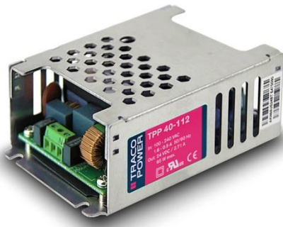
Figure 3: Traco's TPP 40 series is available as both open frame and enclosed

Traco offers both AC/DC and DC/DC solutions for medical applications, all of which fulfil the 2 x MOPP requirement. Compliant with the EMC requirements of IEC 60601-1 (4 th edition), they are suitable for all patient connected, applied parts medical devices (BF compliant). The AC/DC products range from small 5W PCB-mounting modules, a range of mid-power open frame designs, and enclosed power supplies offering power levels of up to 450W.