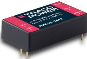
Figure 4: The 15 Watt THM series is a PCB-mount medical DC/DC converter

All of Traco's medically-approved DC/DC converters offer 5000VACrms of input-output isolation that is rated for a 250VACrms working voltage. This, along with leakage currents below 2 \mu A, make them ideal choices for use in conjunction with non-approved AC/DC PSUs in safety-critical medical applications.